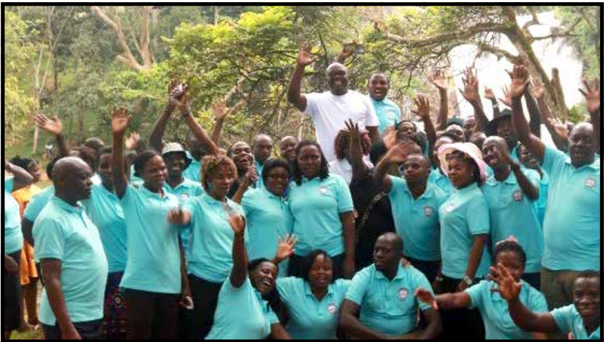
MTAC Teaching and Non Teaching Staff