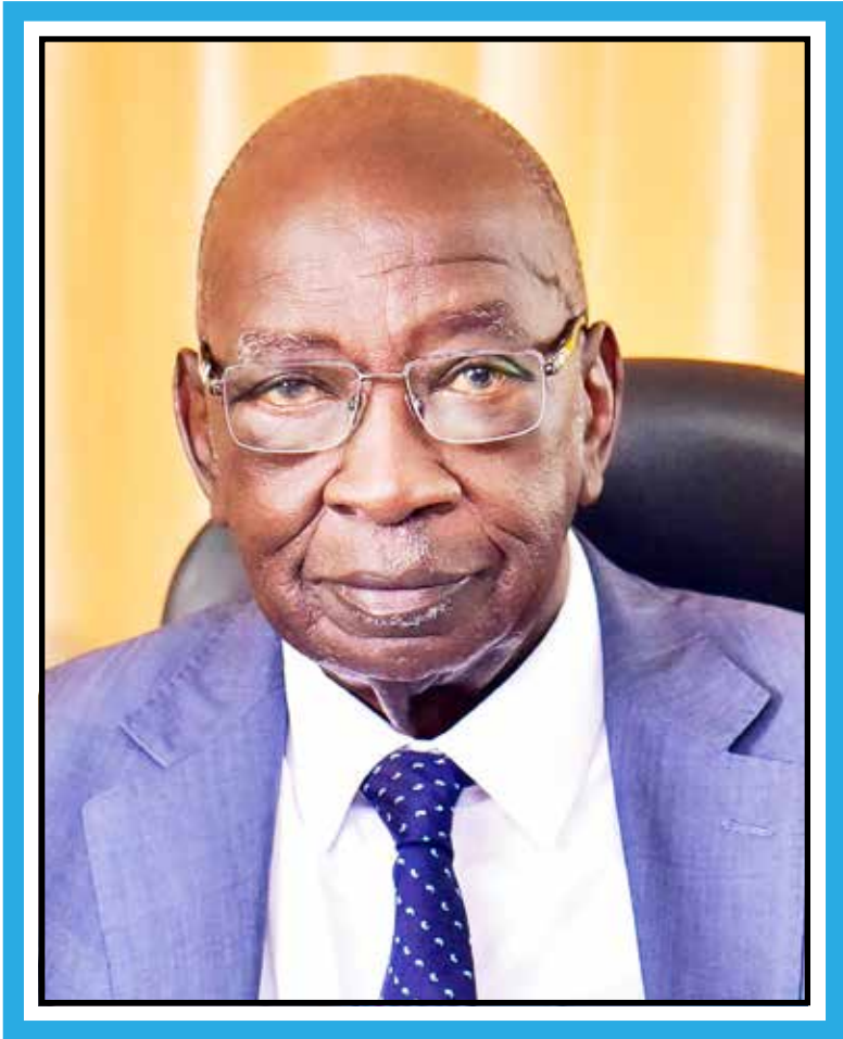
HON. MWEBESA FRANCIS Minister of Trade, Industry and Cooperatives