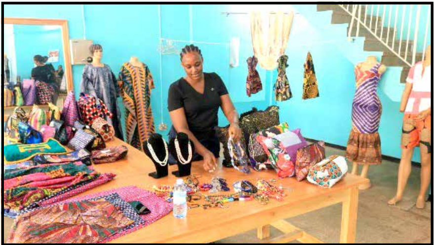
Some of the products made by the students of Tailoring, Fashion and Design