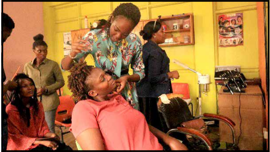
MTAC Hairdressing Students during a Practical