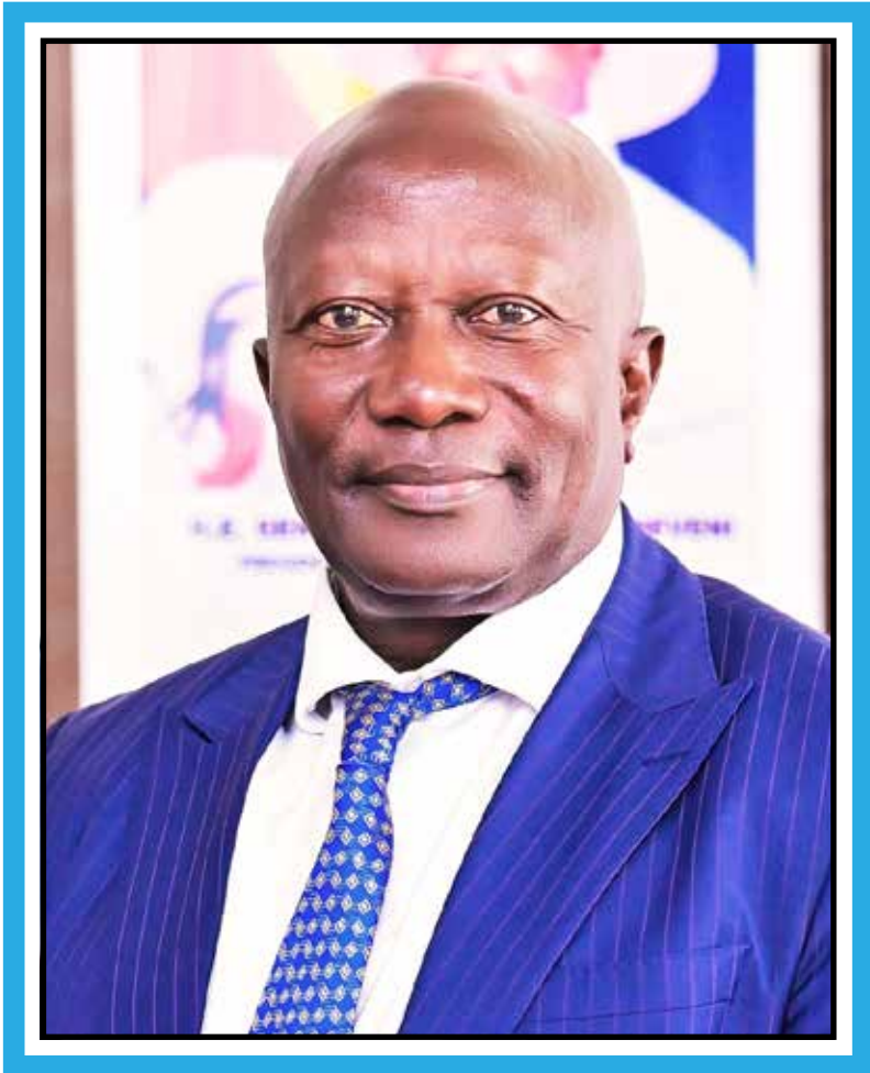
HON. GUME FREDRICK NGOBI (MP)