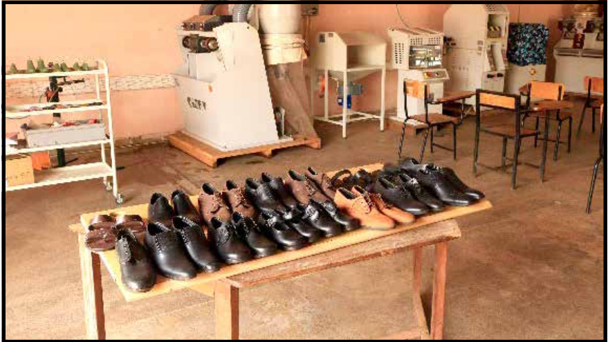
A section of the modern design studio hosted at MTAC with some of the products,