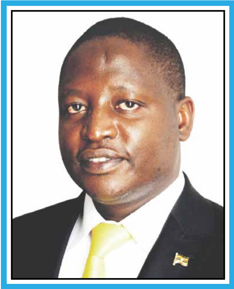
HON. DAVID BAHATI Minister of State for Industry