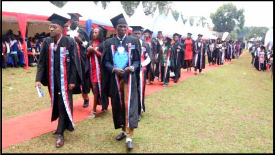
Some of MTAC Graduands of the 9th Graduation