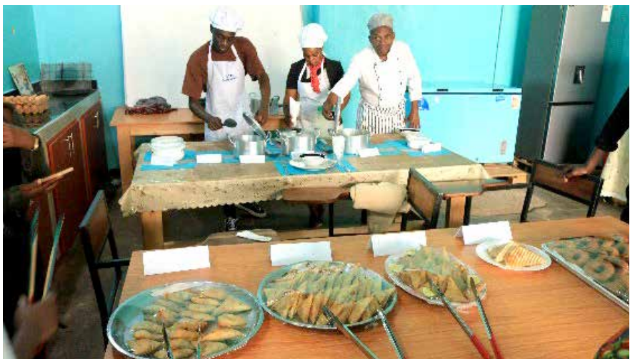
Some of the MTAC Bakery and Cookery products